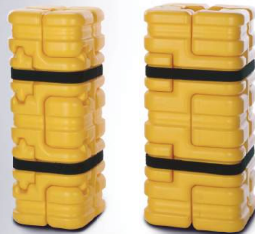
Column Sentry FIT Small 4" x 4" to 8" x 8"

Each of the Column Sentry FIT pieces slides along a patented interactive spine, connecting with its neighboring pieces, assuring not only adjustability, but spreading impact absorption among several pieces. This allows equal protection all around the column. The FIT small and medium expand or contract to fit a multitude of column sizes between 4" and 12" square.